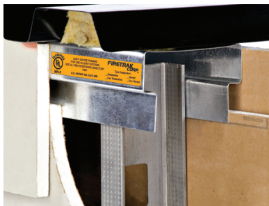
STANDARD WALL 1" MOVEMENT