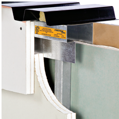
Fire Trak 2 Hr. Cavity Shadowline Shaft Wall - 2" Deflection