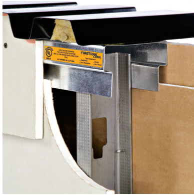
Fire Trak 1 Hr. Shadowline Standard Wall - 1" Deflection