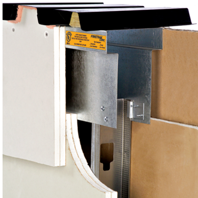
Fire Trak 2 Hr. Shadowline Standard Wall - 6" Deflection